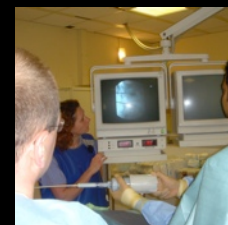
How to set up a service and optimise your service