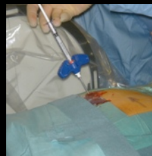
Reimbursement, does it pay ?